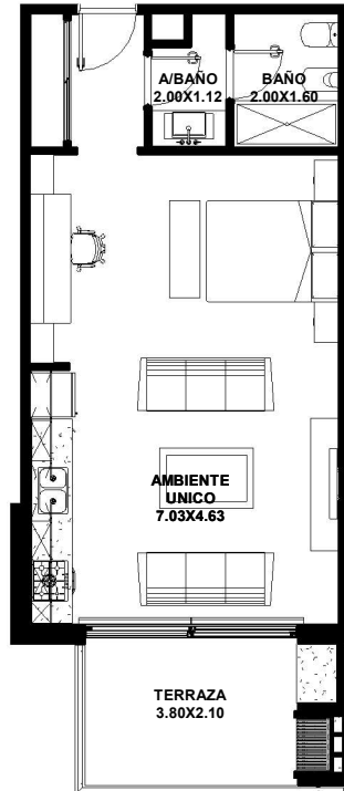
1 EDIFICIO 1 - U 211 1 : 125